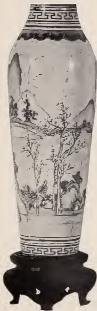
LITTLE OLD ENAMELLED VASE